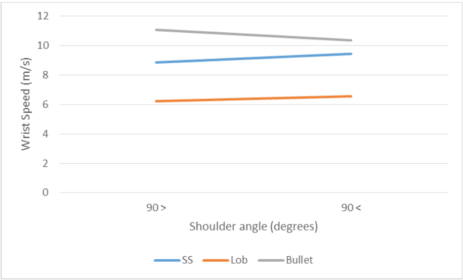
Figure 3 Mean wrist speed comparisons of throw type by shoulder angle (greater or less than 90<sup>o</sup>).

DISCUSSION: For the SS throw, when the shoulder was angled less than 90° the scores were the highest. These findings disagree with recent research by Kerr (2013) It is possible that without specific constraints of throwing a particular pass (SS) that the subjects felt the most comfortable throwing with the below 90 shoulder angle. For the lob and bullet throw, more points were scored when the shoulder was more than 90°, which was in agreement with Kerr (2013). This suggests that greater shoulder angle will result in better accuracy for this type of throw. When not constrained by the type of throw and shoulder position, modifications to improve accuracy may be possible.