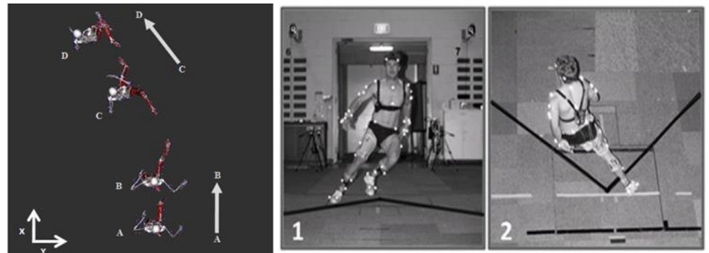
Figure 1. Transverse and frontal view of the sidestep sport manoeuvres conducted during biomechanical testing. Mid pelvis position (x, y) coordinates 50 frames prior to heel contact (A), at heel contact (B) (A-B defines the pre-contact phase), contralateral leg heel contact (C) and ipsilateral leg mid swing (D) were used to define vectors AB and CD. The cosine of the dot product between vectors AB and CD represents a participants CoD angle during sidestepping. Adapted from (Donnelly et al., 2012a).

METHODS: The Australian national women's hockey team participated in an 8-week bodyweight based training intervention focused on improving the dynamic control of the trunk and hip during dynamic sporting tasks. This multifactorial intervention encompassed plyometric, balance and strength body-weight based exercises (see www.youtube.com/bodyfitworkouts for all exercises) and was implemented for 15 minutes, four times a week alongside their regular in-season training schedule. Thirteen athletes (22.2±2.9yrs, 1.67±0.1m, 66.3±6.7kg) participated in biomechanical testing prior to, and following the intervention. During biomechanical testing, athletes were asked to perform a series of planned and unplanned straight line and change of direction running tasks (Figure 1) (Besier et al., 2001; Dempsey et al., 2009; Donnelly, Elliott, Doyle, Finch, Dempsey, Lloyd, 2012a).