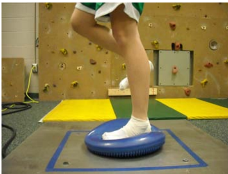
Figure 1. Subject balancing on the dyna-disc.