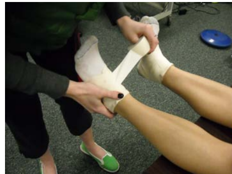
Figure 2. Application of the cloth wrap.

RESULTS: Analysis of variance found no differences across the injuries, left and right sides, or genders. The only significant difference ( p < 0.001 ) found were the main effects for condition (B vs. W vs. U). There were no significant differences across the conditions, genders, or right versus left foot ( p > 0.05 ). In addition, a significant interaction of condition by gender was found ( p = 0.034 ). None of the other interactions were significant ( p > 0.05 ). The interaction of gender and condition and their values are illustrated in Figure 3.