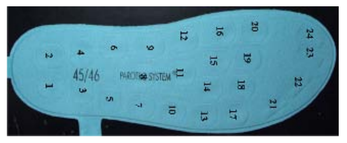
Figure 1: A Numbered Parotec Insole (right foot)

2004). In order to investigate optimization of dimensionality of the input vector from 24 individual sensor inputs, the pressure sensors were grouped four different ways based on their relative contribution to the output torque. All sensor groupings took into account knowledge that the pressure distribution during the torque motion changes from uniform pressure distribution across the foot to more pressure on the medial side. Using this premise, sensor grouping A divided the insole into medial and lateral halves, leaving out the sensor sthat fell along the center line (sensors 8 and 11). Sensor grouping B divided the sensor data into three groups, medial, lateral, and a center group. It was assumed that this grouping would improve upon Sensor Grouping A by adding a group in the center to track the lateral to medial pressure change. Groupings C and D further refined the clusters by breaking up sensor groupings across the foot. This was done to allow the networks to have better prediction capabilities due to possible changes in pressure in the anterior/posterior direction during the motion.