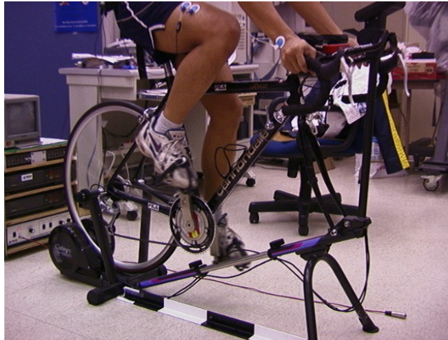
Figure 1 - Photograph shows the subject pedalling on an On-road bike which was mounted on a cyclosimulator. A SRM powermeter system (chainring) was fixed on the bike.

BTS TELEMG system. Two miniature electrodes (Medicotest, silver / silver chloride, P-00-S, 1.5cm contact diameter, 3.5cm inter-electrode distance) were placed over the belly of vastus lateralis muscle of dominant leg and a reference electrode was placed over the pisiform on wrist joint. Before attaching the electrodes, the skin was shaved, and rubbed with alcohol in order to lower the skin resistance. The recorded data were digitized at a sampling rate of 2kHz and the iEMG was calculated every 20s interval. The increase in the iEMG as a function of time, i.e. the iEMG slope, (Moritani, Takaishi, & Matsumoto, 1993) was applied as a criterion to compare the degree of neuromuscular fatigue during cycling exercises with different pedalling rates versus a given intensity of the athletes. The gradient of iEMG slope could reflect the rate of neuromuscular fatigue of the subject at different pedalling rates.