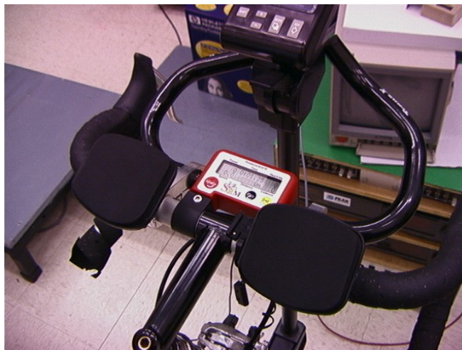
Figure 2 - Photograph shows the SRM powercontrol unit displayed Information.