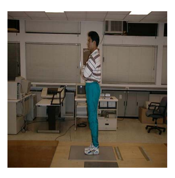
Figure 2 - Form of body sway test.

The dynamic balance test examined the human postural control by determining dynamic balance during balance recovery perturbations. Each subject stood on two legs with eyes open on the Kistler force platform. A cable with tensilmeter (IMADA FB50K) was connected between the subject and capstan (Figure 3). The balance disturbance was created by disconnecting the cable without warning when the cable tension reached 10% of each subject's body weight. Subjects were instructed to recover standing balance as soon as possible after balance disturbance. The amount time of balance recovery was recorded by measuring the time from perturbation to recover standing balance. All data was calculated by Bioware software of Kistler force plate system. T-test was used to examine statistical differences between two groups with significant level at 0.05.