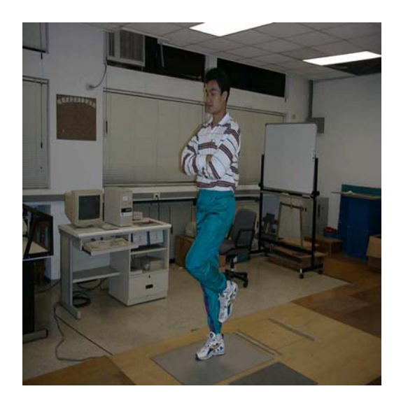
Figure 1 - Standing on one leg with eyes closed form.