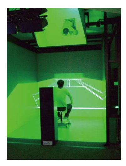
Figure 1: Test CAVE.

Tennis is an interactive sport that is immersive and that involves opponents. In a tennis rally, we experience several types of ground stroke, e.g. flat, topspin or slice, so we should learn the shot properties of each type of ball flight in order to apply anticipatory judgement to the shot (Shim et al. , 2006). CAVE can be an effective tool to help with such training but the reality of the displayed image will have a great influence on the perceptual performance and, eventually, on learning effect. Perceptual assessments are required to use this system practically, thus the aims of this pilot study were as follows: first, to construct a test environment displaying the tennis ball flight in CAVE based on the actual measured value of