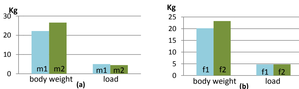
Figure 3 Comparison of body weight and load carriage of (a) first years and (b) second year students

On the other hand, the Text Book Department, MoE Malaysia tries to intervene the load issue through the said strategy “to ensure all text books with 128 pages or more should be divided into two volumes and to stricthen the use of all exercise books where school can only use endorsed exercise books by MoE”. For example, usage of a set of activity and text book and use of any other exercise books is not allowed (Text Books Department website, 2007). Yet the study shows that the strategies do not seem that effective.