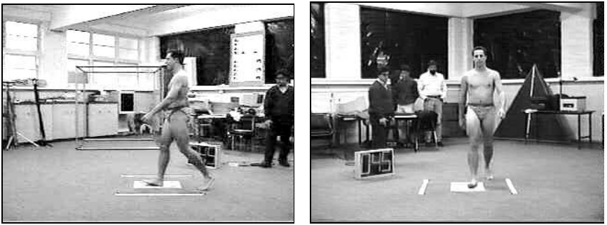
Figure 2 Measurement of fast cadence walking motion

APPLICATION RESULTS: The methodologies described are applied to the gait analysis of a 77 Kg human subject with a fast cadence walking a complete stride. The motion is recorded with two cameras, as shown in Figure 2, and the spatial position of the anatomical points is reconstructed. The ground reactions are measured by a force platform and introduced into the inverse dynamic problem as external applied forces .