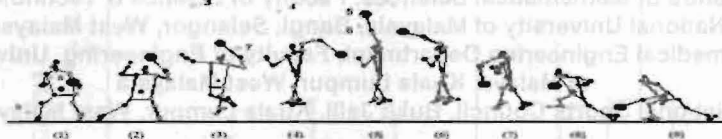
Figure 1 The motion of smash stroke.

Thus a total of 84 trials were involved. Each trial consists of, on average, 60 frames starting from the action of getting ready to the landing position after the smashing stroke.