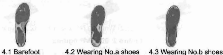
Figure 4 The pressure induced area in buffer.