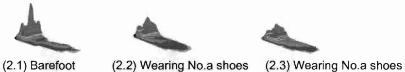
Figure 2 3D-MVP figures.

MVP: As we seen in Figure 1, when he in barefoot, in No.a shoes and in No.b shoes, the MVP values characters of barefoot is 1.204 \text{ N/cm}^2 higher than wearing No.a and 1.64 \text{ N/cm}^2 higher than wearing No.b. The MVP value wearing No.a is 0.463 \text{ N/cm}^2 higher than wearing No.b.