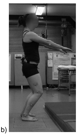
Figure 1 a) Fatigue protocol jump, b) landing from measurement jump or drop

Data Analysis: Acceleration data were filtered using a fourth order low pass Butterworth filter with a cut-off frequencies of 15 Hz. EMG data were treated with a high pass filter with a cut off frequency of 20Hz as well as an anti-aliasing low pass filter with a cut-off frequency of 500Hz prior to data acquisition. Matlab® software was then used to perform Fourier transforms of EMG data for analysis of the mean and median frequencies as well as to calculate peak acceleration during each landing.