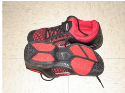
Nike (Air Max Breath Free II)