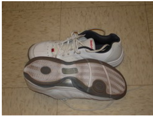
Reebok (Club Smash II)