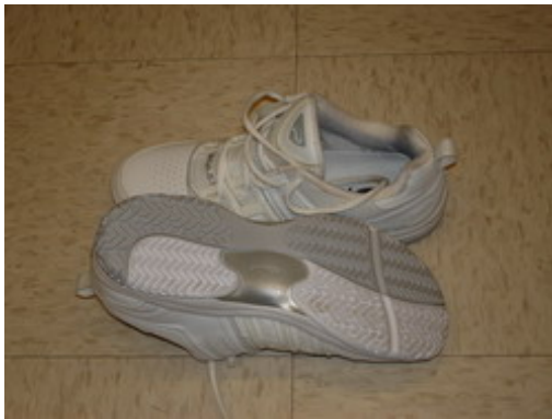
Li-Ning B (2TM5357-1)