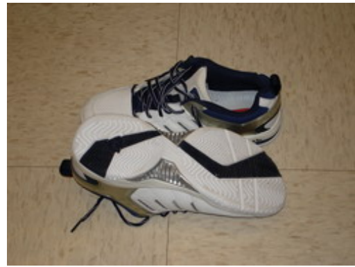
Li-Ning A (TM07-1)