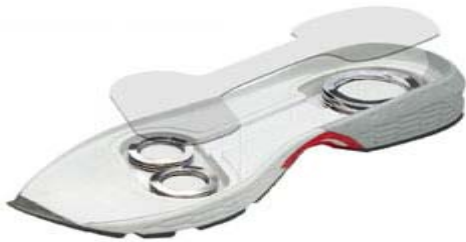
Figure 3. Spira's WaveSpring™ Technology

cell construction of the Nike Air Pegasus 2004 but there was no significant difference ( p=0.1745 ) in time-to-peak force. The Nike Air Pegasus 2004 and the Spira Volare II exhibit two very different designs. Construction of the Nike Air Pegasus 2004 is similar to previous designs of the same model. The Spira Volare II underwent substantial modifications from previous ShoeSpring models. Changes to the Spira Volare's spring system that incorporates 3 springs (Figure 3) rather than 2 springs from previous models may have impacted the significantly lower peak force result (1911.94 N, SD=468.8 ) as compared to the Nike Air Pegasus 2004 (1952.24 N, SD=459.5 ). Peak force values were also normalized to body weight to determine gender effect. A significant shoe by gender interaction was found ( p=0.0320 ). A significant difference in peak force per body weight was found between the Nike Air Pegasus 2004 and Spira Volare II for the females ( p=0.0048 ) but not for the males ( p=0.8544 ). Lower impact forces for female subjects may have resulted from a smaller body mass or the shoe's design.