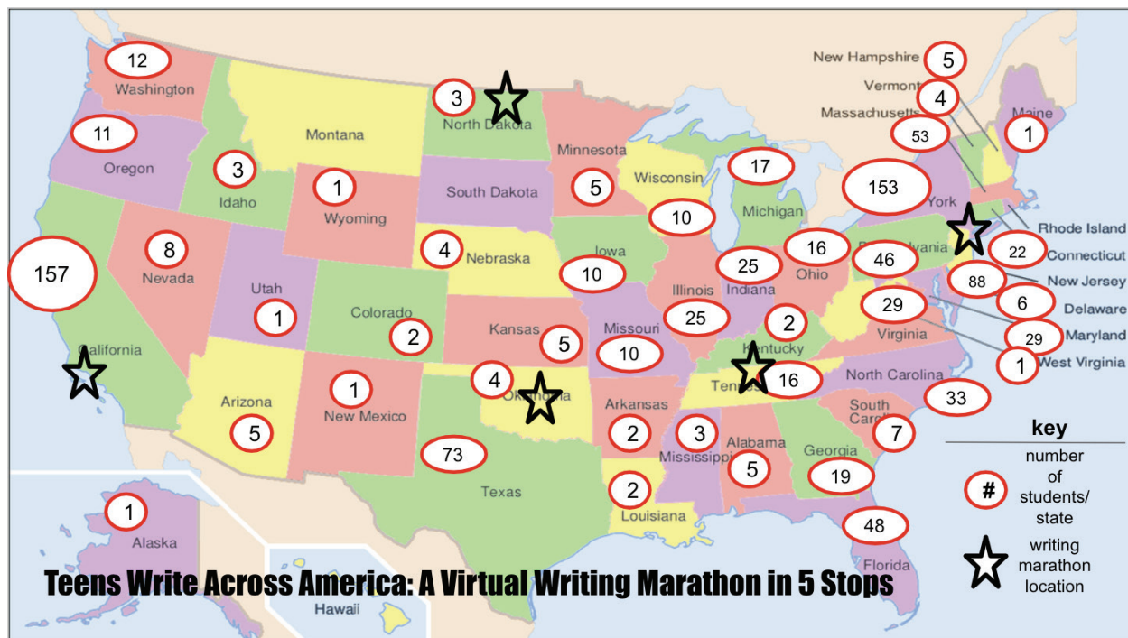
FIGURE 2 The black stars on the map represent the National Writing Project sites that hosted marathon stops, and the red circles indicate the number of participants from each state.