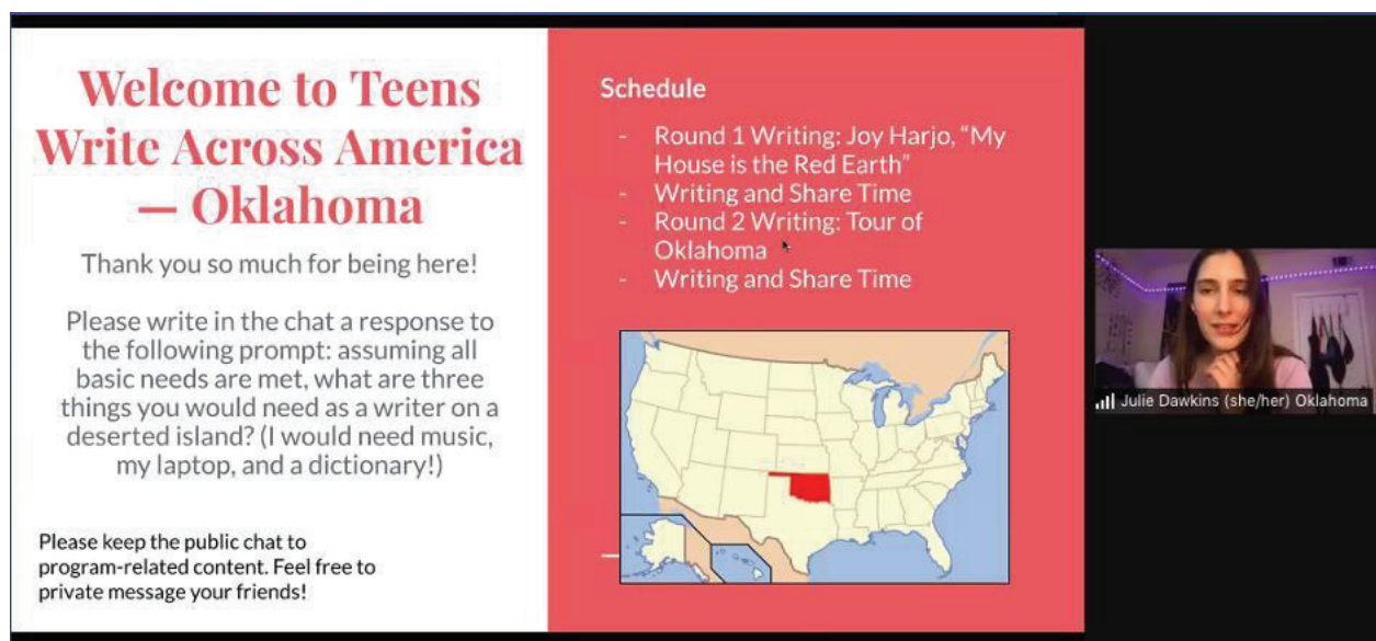
FIGURE 4 The welcome slide for the virtual marathon’s Oklahoma stop shared the opening prompt for writing in the chat and the schedule for the session.

After ten minutes, everyone split into breakout rooms of four or five participants to introduce themselves and share their writing aloud. Students introduced themselves with “My name is _____, and I’m a writer.” Claiming the identity of writer is one of the traditions of the NWP writing marathon. Another tradition is that writers do not apologize for the state