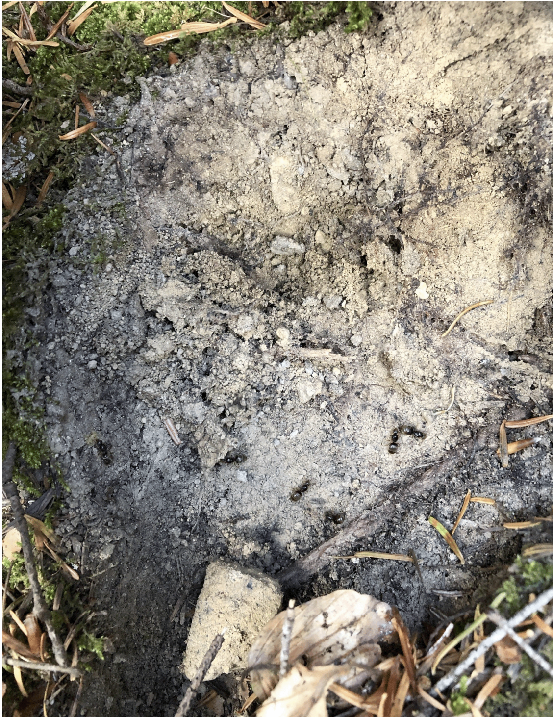
Fig 2. Pleometrotic queens of Lasius flavus found under one rock.

belonging to different genera at least (Hölldobler & Wilson, 1990). Indeed, because both species share the same nesting site and foraging area, interspecific competition may occur (Kanizsai et al., 2013). However, competition can be avoided if the two species have different habits and behavior. In line with this reasoning, the coexistence between L. flavus and M. ruginodis could be achieved through a combination of different biologies, feeding behavior, and activity patterns. While L. flavus is a hypogeic ant feeding underground,