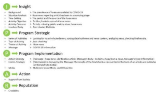
Figure 2. The IPPAR Model: The phases of the fact-checking process for the COVID-19 Hoax news

Source : Research findings and theoretical elaboration (Hidayat et al., 2018).