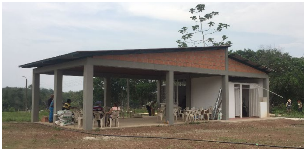
FIGURE 4. Community center of Charrasquera. Photo by authors, 2019