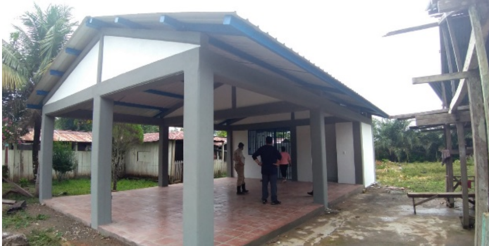
FIGURE 5. Community center of Sabanas de La Fuga. Photo by authors, 2020

The sloped roof responds mainly to the ease of construction and low cost of the system. In the case of San José del Guaviare, which is a highly rainy municipality with a deficit of potable water in the rural area, sloped roofs offer the possibility of implementing rainwater collection systems, which were not considered. Likewise, the rural area of San José del Guaviare does not have electricity coverage, but the radiation levels offer the possibility of implementing solar energy systems, which were not included either. Despite of this, the community centers were built and delivered with the networks ready to be connected to the public systems, ignoring the deficit conditions, and implementing technical solutions for an interconnected place such as a town center.