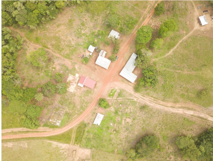
FIGURE 1. Hamlet of Charrasquera.

conditions in the enclosures and finishes. The community decided to keep it and build the new one in the adjacent lot, with the vision of integrating them and improving the existing infrastructure.