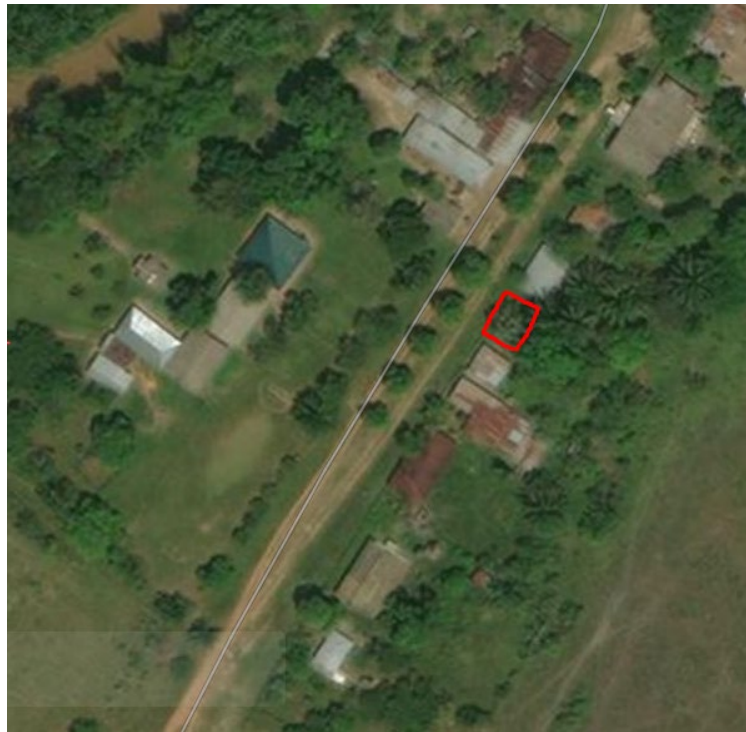
FIGURE 2. Hamlet of Sabanas de La Fuga.