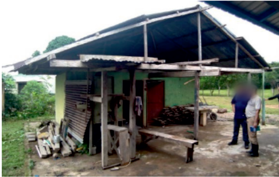
FIGURE 3. Old hut on Sabanas de La Fuga. Photo by the authors, 2020

roof structure are metallic, and the roof tiles are made of galvanized sheet metal color red. This construction system is widely used in Colombia, mainly in population centers where industrialized materials are readily available and where qualified labor for masonry and concrete is easily obtained. However, the environment in which these community centers are located is a jungle environment, more than 3 hours away travelling by deficient roads. Consequently, an architectural typology has been developed in the Amazon region, based mainly on the materials available locally and on the traditional knowledge of the peasant settlers and indigenous people who have populated these territories. Thus, wood has become the most common material used in structures and enclosing walls and zinc roof tiles the most common solution for roofs. (Figure 3, 4 and 5)