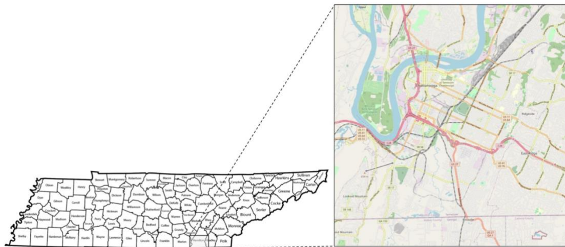
Figure 1. Map of the city of Chattanooga, located in the Hamilton County (Tennessee) (Source: OpenStreetMap).