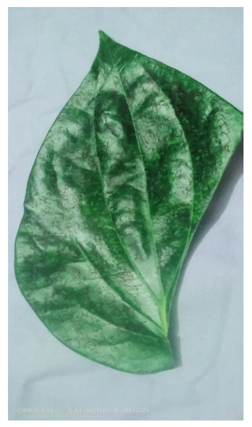
Charm written on betel leaf used for stomach-related problems in both humans and animals.

Additional instant relief prescribed for stomachaches is taking a pinch of ordinary salt or Himalayan black salt with lukewarm water. The charmer asks the clients to bring ingredients of these home remedies to her and she performs charms on them in order to increase their potency. هو الشافى [He (God) cures] is recited 99 times on these ingredients.