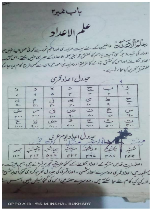
Table used to convert Quranic verses into numbers.

"We mostly take the treatment from the Quran but if there isn't anything that is neither mentioned in the Quran nor the Hadith, then we look out to other disciplines. We take help from numerology, geomancy, knowledge of incantation, and sometimes astrology. The ultimate purpose