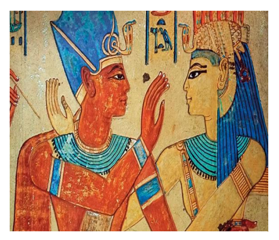
The goddess Isis embraces Pharaoh Ramses III.

For example, a picture on the wall of the tomb of King Rameses III of Egypt shows Isis (Egyptian goddess) as a healer. Queen Mentuhetep (2300 BC), Hatshepsut (1500 BC) and Cleopatra (100 BC) were noteworthy physicians.