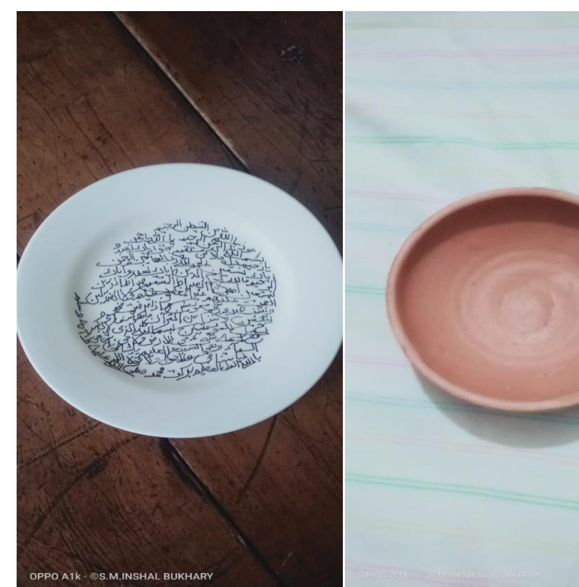
Charm written on a porcelain plate for the treatment of depression and anxiety.

The above-mentioned ayat is also recited on the bridal dress and bride's makeup kit to protect her from the evil eye.