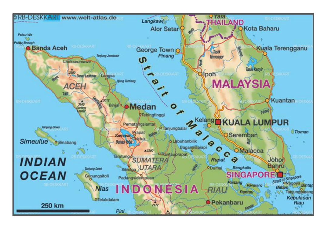
Figure 1.2 Straits of Malacca map (Welt-Atlas.de, 2018)

be more than 100,000 as the traffic's density are increasing at the average of more than six thousand per month (Awaludin and Abu, 2017).