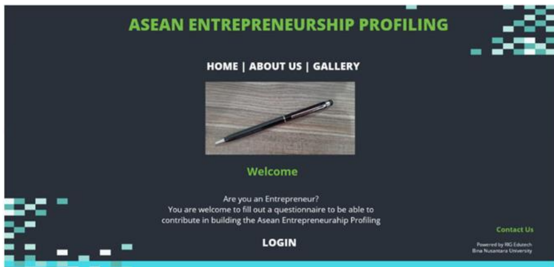
Figure 2. Prototype Website