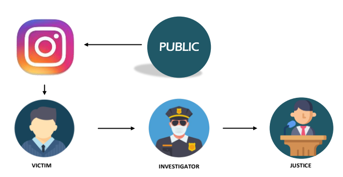
Fig. 2 Case simulation

namely classification. There are several datasets sourced from: