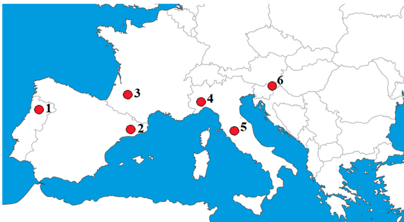
Figure 3. Locations of hazelnut sampling for the phenolic analysis: 1—Vila Real, Portugal (PTG); 2—Constantí, Spain (SPA); 3—Puéchoursi and Montesqieu, France (FRA); 4—Cravanzana, Italy (ITN); 5—Viterbo, Italy (ITS); 6—Maribor, Slovenia (SLO).

Five cultivars, namely ‘Tonda Gentile delle Langhe’, ‘Merveille de Bollwiller’, ‘Pauetet’, ‘Tonda di Giffoni’, and ‘Barcelona’ (syn. ‘Fertile de Coutard’, ‘Castanyera’, ‘Grada’) were included in the study. Kernel samples were collected in five European countries, namely Italy, France, Spain, Portugal, and Slovenia. In Italy, the ENEA (ITS) and University of Torino (ITN) collected the samples in Le Cese (Viterbo) and Cravanzana (Cuneo), respectively. In France (FRA), the nuts were provided by the ANPN from Puéchoursi and Montesqieu collections. In Spain (SPA), the samples were taken by the IRTA Mas Bove in Constantí germplasm collection. In Portugal (PTG), the UTAD provided samples from the collection in Vila Real, and in Slovenia (SLO), the Biotechnical Faculty took samples at the Maribor collection orchard (Figure 3). All samples were collected in the same growing season. The locations differ in their geographical and climatological features, soil properties, and orchard characteristics, which are detailed in Table 5.