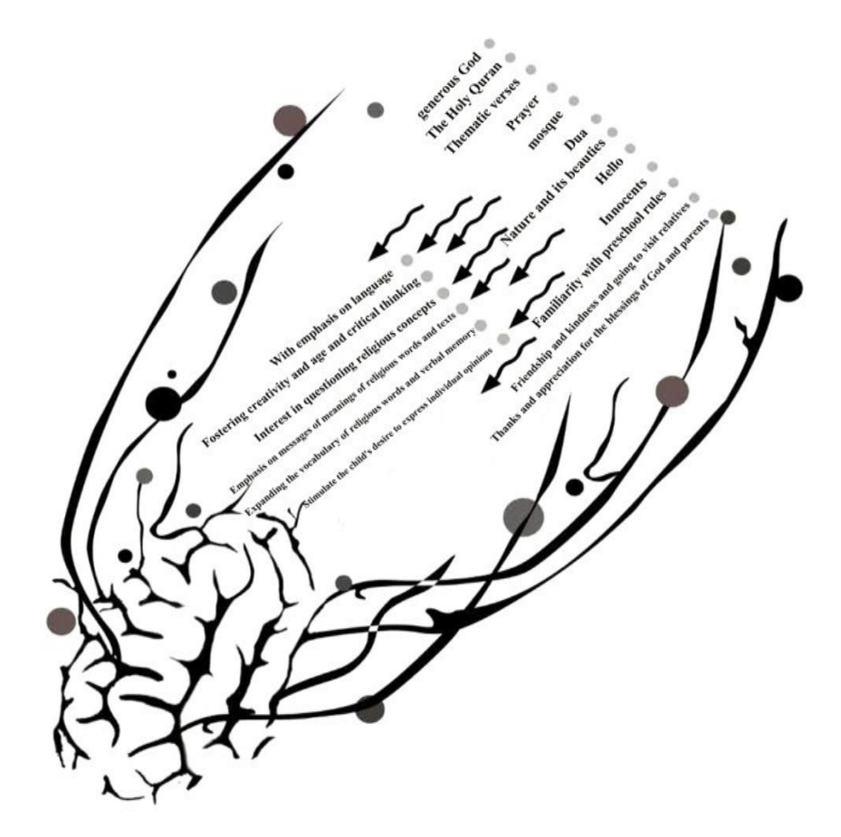
Figure 2 - Presenting concepts with an approach (hermeneutics) based on emphasis components.

truthfulness, chastity, trustworthiness, etc. are rooted in nature and are virtuous if there are suitable educational conditions.Since in hermeneutic philosophy the goal is the interaction between the learner and the text, in this part of the curriculum the instructor presents a topic according to the children's interest. In the classroom, by asking and answering and expressing the child's thoughts, encouraging speaking and creating a dialectical environment, he pays attention to all the children's ideas and, more importantly, does not correct the children's ideas. Every opinion must be respected. At the end of the discourse, the instructor does not draw conclusions from the lesson and leaves the children free to think about the subject. Also, the answers that are creative are encouraged by the instructor.