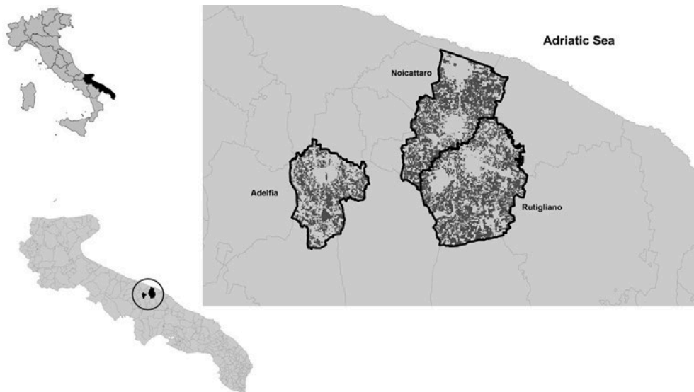
Figure 1. Distribution of vineyards in the area of study.

study adds to the growing literature that employs the CE and SPF for the preservation of Mediterranean natural resources. Findings have implications for debates concerning costs and benefits aimed at preserving water resource, allowing the verification of the strategies in force and the planning of ad hoc and cost-effective programmes.