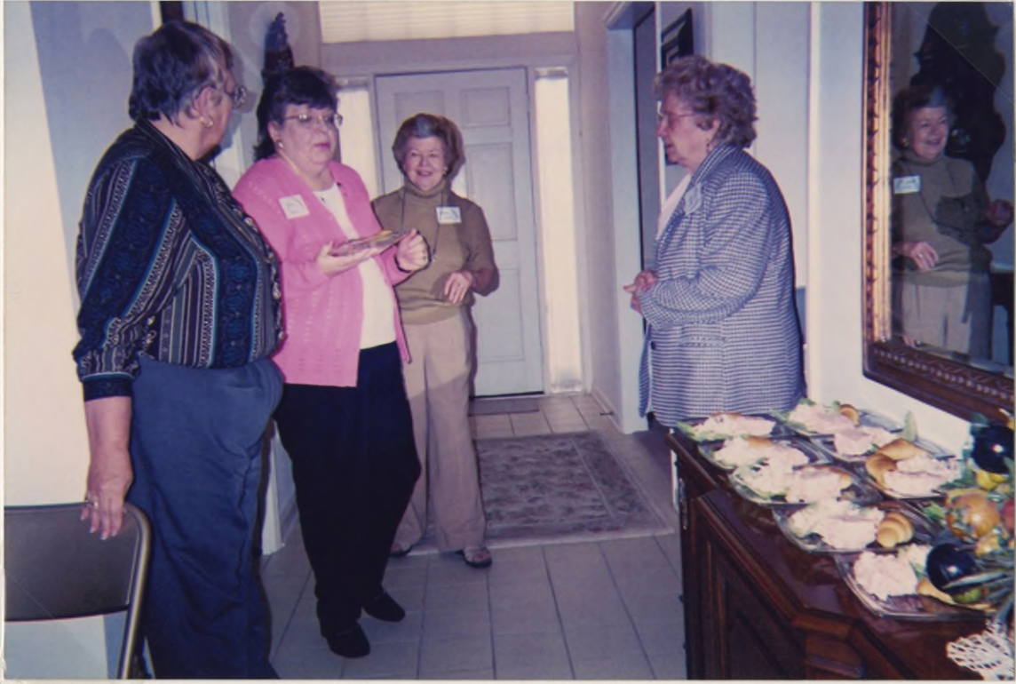
Waggoner circle Christmas Party