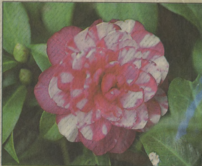
Ki Ku Toji camellia

Visitors to both shows can win camellia plants as door prizes.