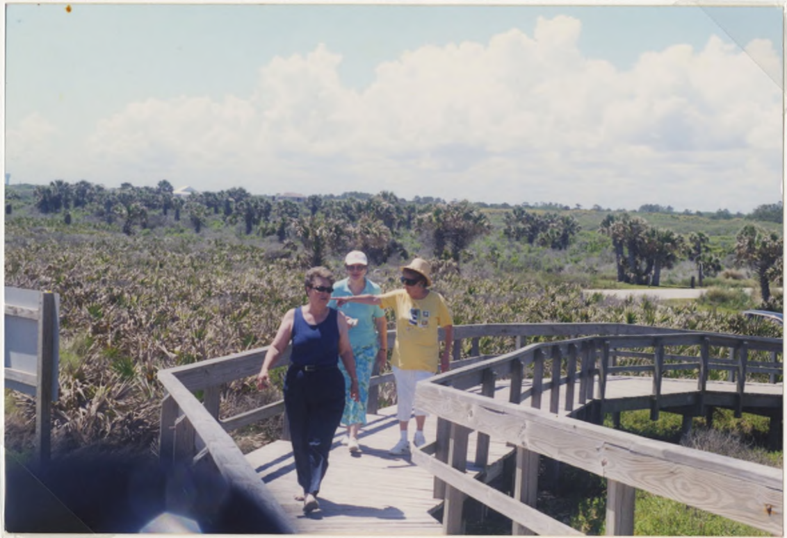
Washington STATE PARK CR. 2002