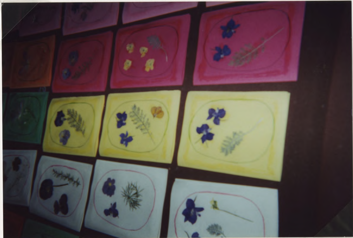
Pressed Flower Cards made by Children of Loretto School Shirley ward