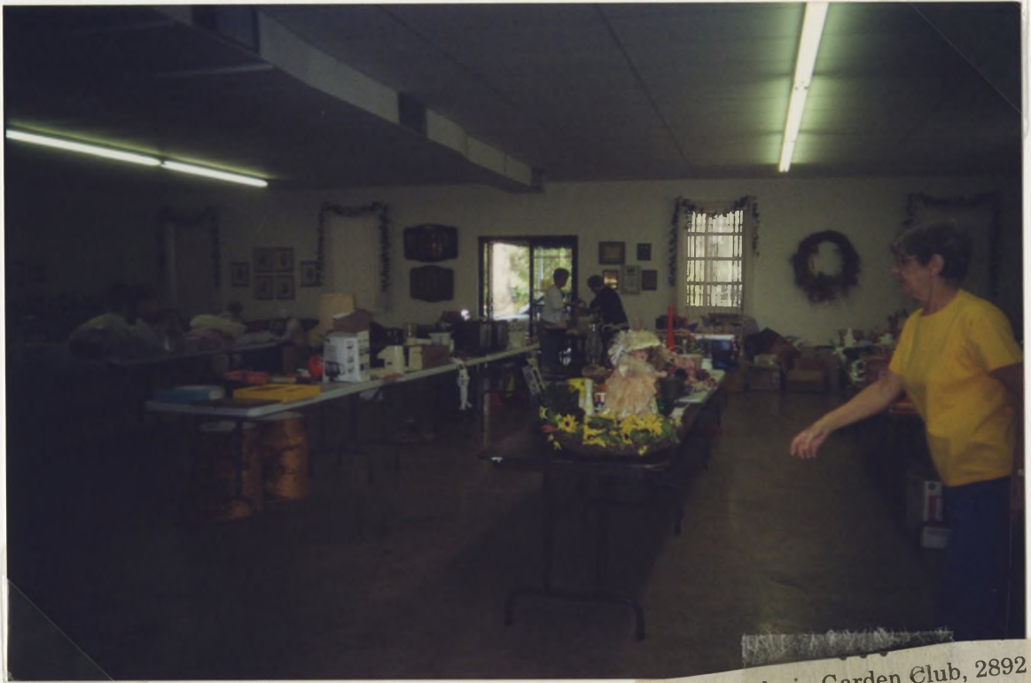
Mandarin Garden Club, 2892 Loretto Road, will hold its annual garage sale from 9 a.m. to 3 p.m. Articles for sale include six 6-ft. folding tables, plus a bake sale and free coffee.