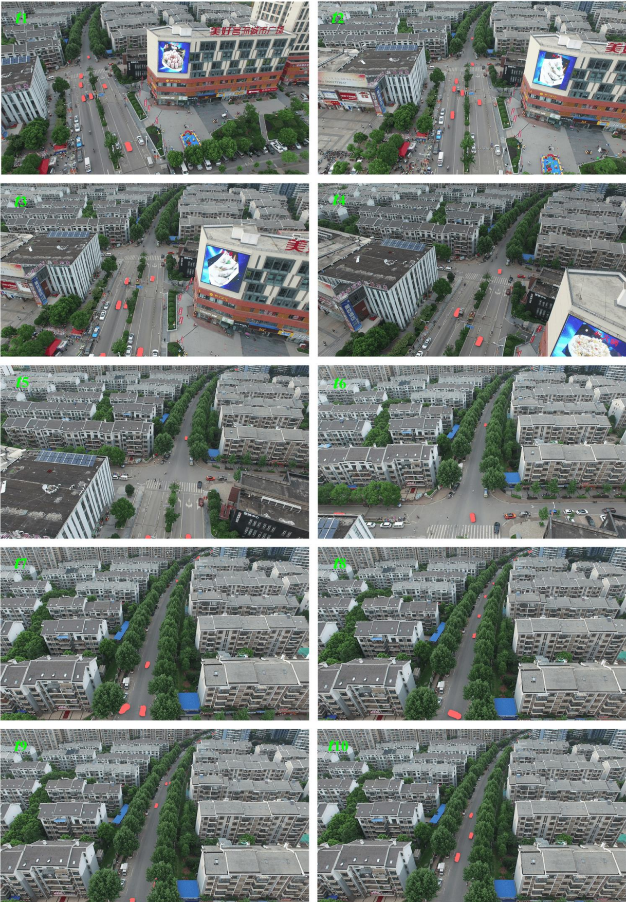
Figure 2. Example time-series vehicle detection from oblique UAV images. Red footprints indicate all vehicle instances