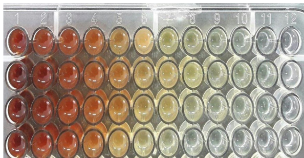
Figure 1. Minimum Inhibitory Concentrations of Myricetin Against Streptococcus mutans Isolates .

In the present study, according to the binding site of the myricetin inhibitor in the Srt A enzyme and its inhibitory mechanism, first, a total of 20 ligands having a high degree of similarity with the myricetin molecule were selected and then analyzed via AutoDock (Figure 2). The matching between the structure of Srt A with myricetin and the ligands represented that the location of the active site is similar. The ligands were docked against Srt A for confirming the validity of the active site. The findings revealed that the key residues phe143 and thr146 were localized in the anticipated active center, and two or three hydrogen bonds between Srt A and its ligands were generated accordingly. This result demonstrated that the determined active site in the Srt A enzyme via AutoDock is comparatively precise and can be used for further virtual screening. The testing sets including 5 positive and 15 negative ligands were applied to measure the accuracy of AutoDock for screening Srt A inhibitors. The 50% of top-ranked ligands were docked via the Hawkins GB/SA score, accounted for 0.95 of the highest area under the receiver operating characteristic curve (data not shown). After studying the pharmacokinetic and quasi-pharmacological properties of the ligands, a total of 4 ligands having a high