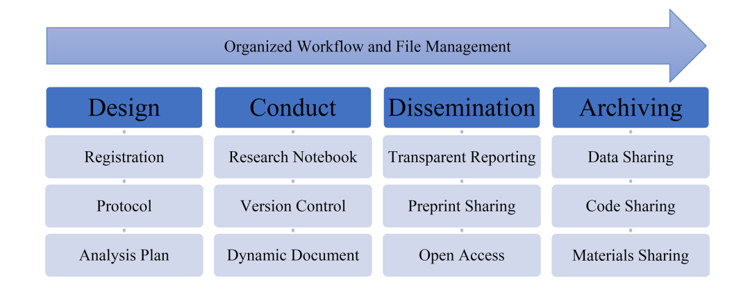
Fig. 1 Roadmap for a Transparent, Open, and Reproducible Research Lifecycle. Note: Figure adapted from the roadmap co-developed by SG for the Berkeley Initiative for Transparency in the Social Sciences Research Transparency and Reproducibility Training (RT2) workshops: https://www.bitss. org/resource-library/

follow, we describe open science practices in greater detail, along with a description of the stakeholders and contexts of research that contribute to a need for greater openness and transparency. We then connect these activities and concepts to prevention science research practices.