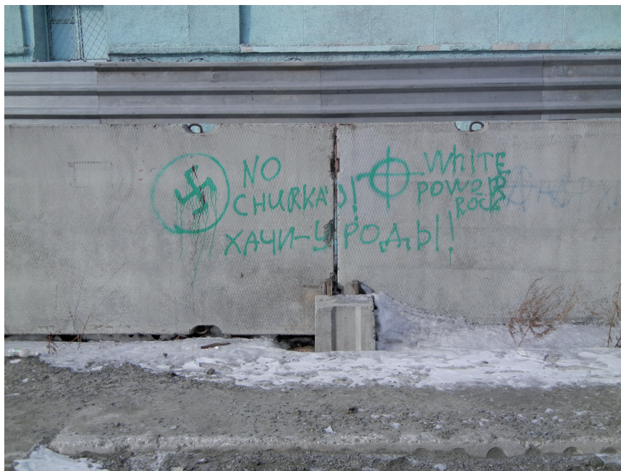
Figure 2: Graffiti on a factory’s perimeter fencing in Dzerzhinskii Raion, a district of Novosibirsk. Svastika and cross hairs are accompanied with the slogans ‘No churka’s’, ‘White Power Rock’ and ‘Khachi – urody!’ (‘Hadjis are monsters!’).