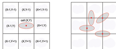
Figure 1. The C^3 sky partitioning method. The sky is partitioned in cells whose dimensions are determined by the maximum dimension that the matching regions can assume (panel a ). Each source of the second catalogue is assigned to a cell; a source and an ellipse referred to a first catalogue object can match only if the source lies within the nine cells surrounding the object (panel b ).

In order to increase the performance in terms of computational time, C^3 makes use of two different methods: i ) a massive application of multi-core parallel processing paradigm, managed by defining, in the configuration file, the number of concurrent parallel processes; ii ) a sky partitioning algorithm, in order to reduce the number of checks between the two catalogues. A subsample of the first input catalogue is assigned to each concurrent process, while the objects of the second catalogue are assigned to one of the cells defined by the partitioning procedure, according to their coordinates. The size of the unit cell is defined by the maximum dimension that the matching regions can assume, (Fig. 1a) . The described choice to set the dimensions of the cells ensures that the matching between an object of the first and a source of the second catalogue can happen only if the source lies in the nine cells surrounding the object, (Fig. 1b).