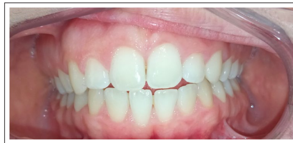
Figure 5. Clinical condition after photodynamic therapy in frontal view.

The patient improved markedly after only one cycle of PDT. There was an absence of clinically-detectable inflammation, edema, and rubor of the involved dental papillae (Figures 5 and 6). At the 4, 6, and 12 week follow-ups there were no recurrences. A noteworthy aspect is that the patient was not subjected to any oral hygiene practices in the outpatient setting and therefore the therapeutic effects are entirely attributable to PDT.