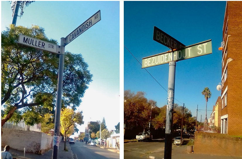
Fig 1, Fig. 2: Street signs bearing street names in Yeoville.

South African authorities have, over the years, grappled with the politics of naming in terms of streets and buildings. If you go into the city centre in Johannesburg, nearly all the streets and major buildings have been renamed after African liberation heroes including Nelson Mandela, Oliver Tambo, and Reginald Luthuli, to mention a few. The recent addition is the Winnie Mandela House, which is the newly unveiled headquarters of the opposition, the Economic Freedom Fighters