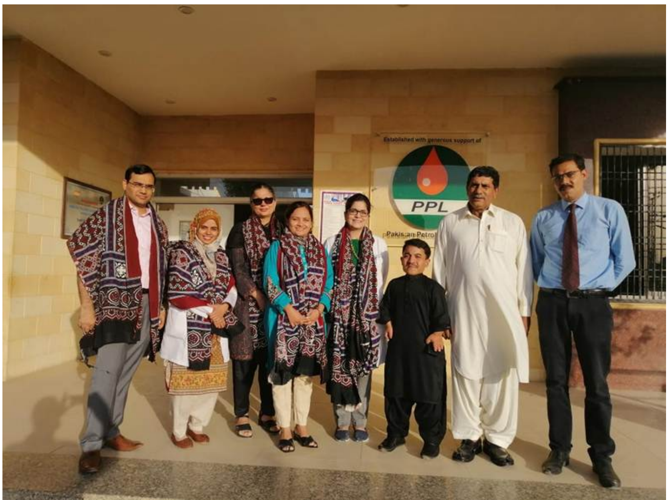
AKU faculty participated in a CME Seminar on Hormonal Imbalances at Munna Bhai Thalassaemia Care Centre, Badin