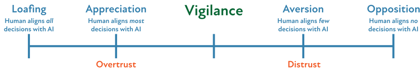
Figure 1. Scale of user attitudes toward AI in human-AI teams

forecasts exclusively, most participants who had not seen the algorithm perform chose to rely on the algorithm exclusively, while most of those who had seen the algorithm perform (and hence err) chose to rely on human judgment, despite observing the algorithm's better performance. 14 It has been suggested that this effect is greater for obvious errors than for subtle ones, because obvious errors can quite drastically upset a user's initially high expectations of a system's competence. 5 Moreover, a user's expertise can affect their perception of machine errors. 3 Users who are expert or self-confident in tasks that have been delegated to automation tend to ignore machine advice 45 and, as a result, make less-accurate predictions relative to lay people willing to follow machine advice. 5,14,15