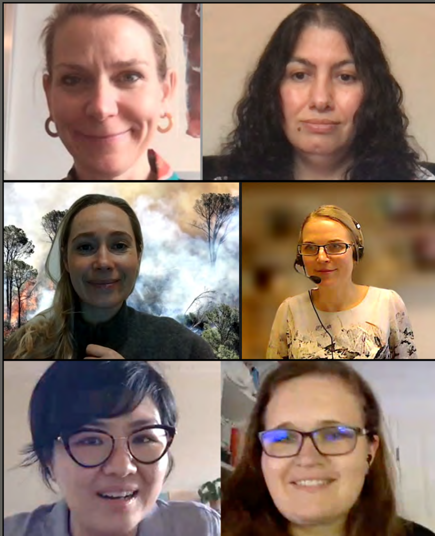
Images of the participants