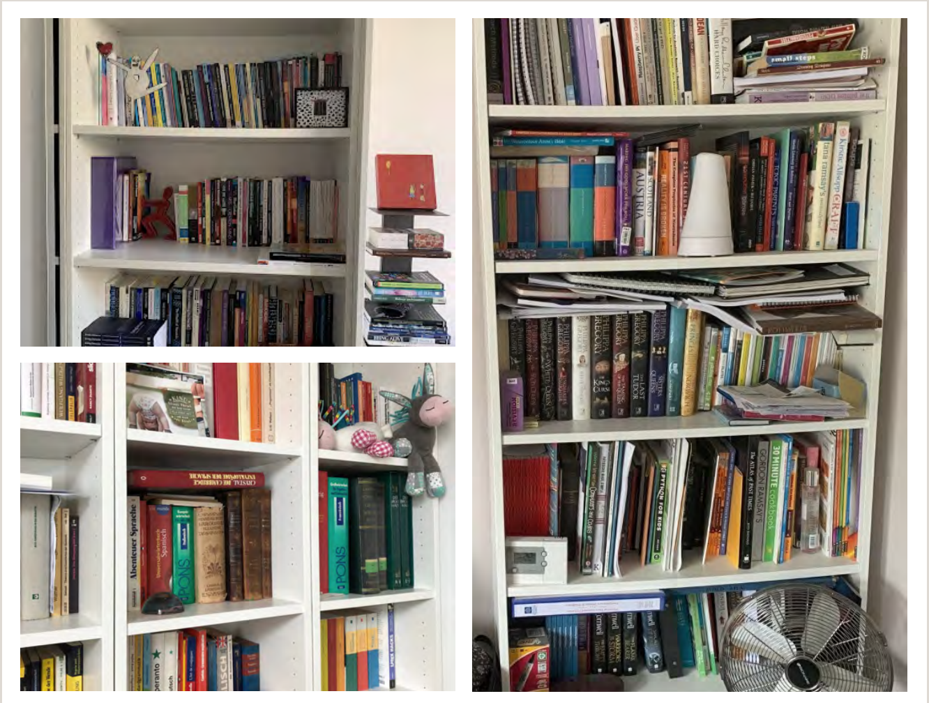
The participants' shelfies