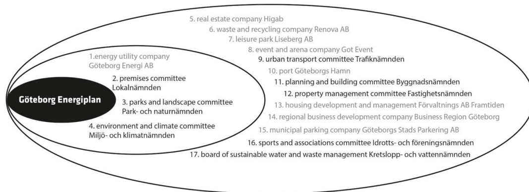
Figure 1. Municipal stakeholders with dedicated measures in Gothenburg Energy Plan, stakeholders 1-4 have key measures. Black: boards/committees. Grey: companies owned by City of Gothenburg.

is the availability of resources to make decarbonization happen. Staff, knowledge and money for investments are necessary. However, once available, resources have to be used wisely, supported by solid business plans for investments and collaboration between municipality and companies.