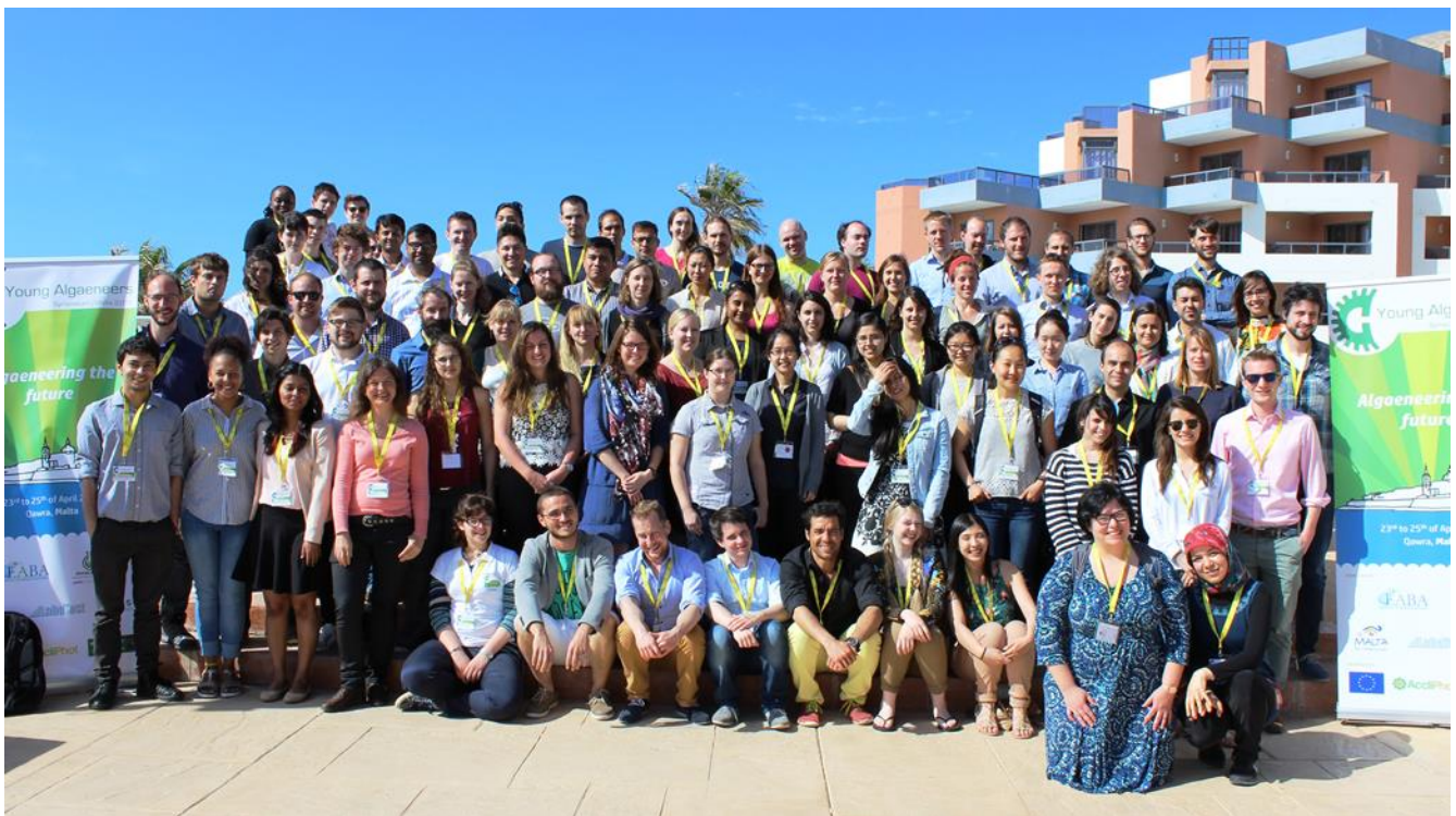
Figure 1: YAS2016 group photograph