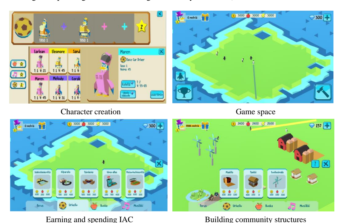
Figure 1 . Visual display screenshots of the exergame

The PA levels are measured through various sensors available on the mobile device. The health objective of the game is to increase the player's PA levels by rewarding success progressions in the exergame. The exergame provides vicarious experiences, positive feedback, and fun for players, which are all important sources for self-efficacy [47]. Figure 1 shows four excerpts of the exergame's visual display (character creation, game space, earning and spending IAC and building community structures).