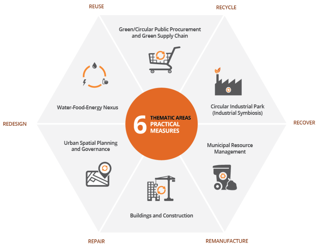
Picture 1. ICLEI thematic sectors and practical measures 3

ICLEI has determined six thematic sectors to implement circular economy.