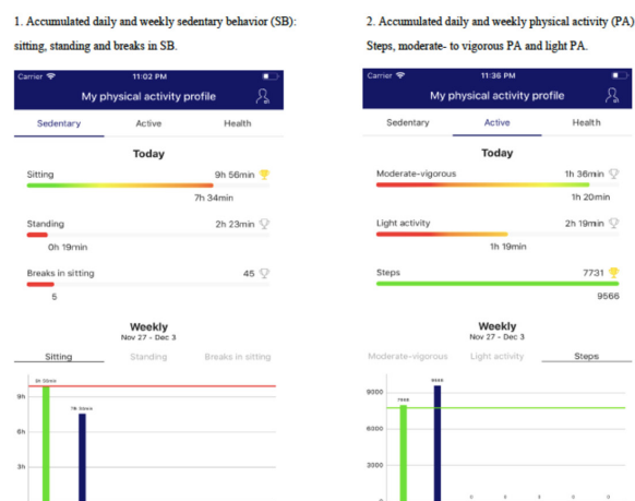
Figure 2 The contacts with the eHealth intervention patient and the view of the ExSed application for eHealth intervention patients.

goals online to make them more suitable for each patient (figure 2).