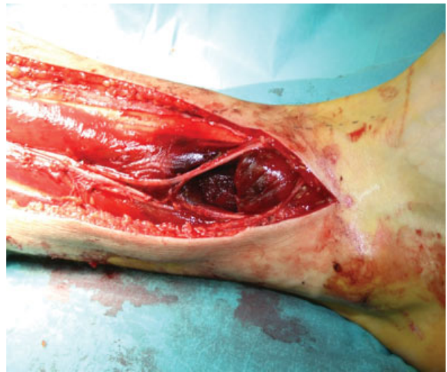
Fig. 2 Due to compartment syndrome, full-length fasciotomy of the anterior and peroneal compartments was performed. The peroneal nerve had a slight hourglass-shape at the site of the entrapment. The muscle belly of the peroneus tertius muscle was totally ruptured.

ankle. The dorsiflexion of the ankle was 10 degrees decreased compared with the healthy side. No deformity was present, although some wasting persisted in the area, observed as a small pit in the ankle. The patient had resumed to physical activity without pain or discomfort. After a follow-up time of 3 years, no new treatments have been needed.