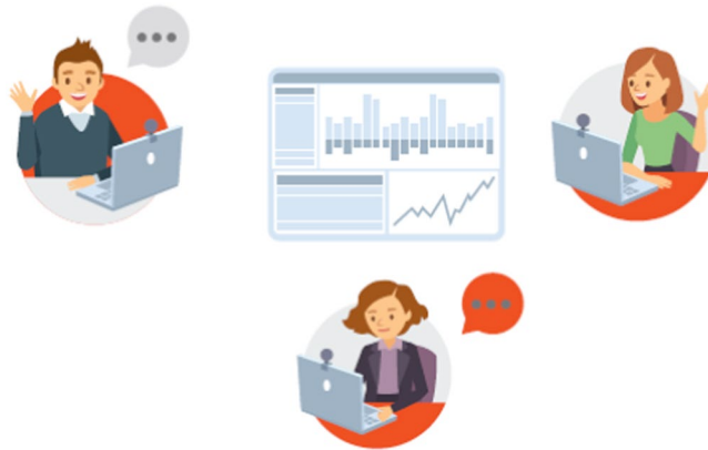
Figure 2. Virtual setting of the simulation game: students remotely connected to the simulation are looking at the same view on their computer screens while engaged in a synchronous discussion using VoIP.

teamwork and which software solutions they would use for organizing their teamwork and for communicating.