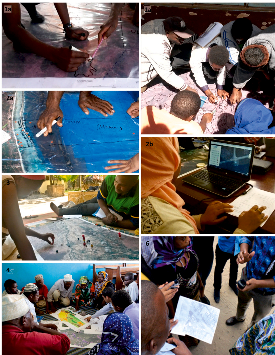
Fig. 1. PM method use in the studied cases. Case 1a) collective mapping of land use areas using marker pens; case 1a) collective planning and mapping of future land use allocation; case 2a) collective mapping of marine and coastal activities using marker pens and stickers; case 2b) representatives of expert organizations mapping marine and coastal threats using on-line mapping survey; case 3) mapping of individual's provisioning and cultural ecosystem services using wooden beads; case 4) group discussion on mapping results; case 6) mapping of community assets and flood risks using printouts of drone images and Open Data Kit.

We selected 6 PM cases from Tanzania into this study. These cases have applied PM methods in village land use planning (cases 1a and b), local area planning (cases 2a and b), landscape research (cases 3–5) and urban flood risk assessment and planning (case 6) (Fig. 1 and Table A.1).