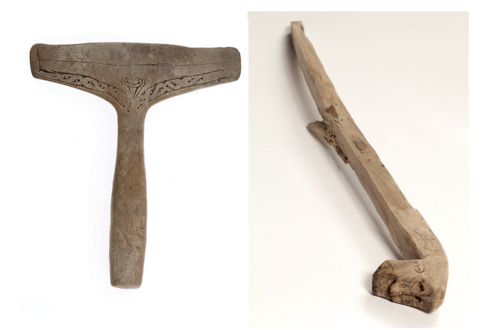
Figure 3 . The Sámi shaman hammer and juniper staff found concealed under the floor of an early fifteenth century two-roomed dwelling house.

Firstly, a T-shaped object made of antler<sup>36</sup> had been concealed within the birch bark insulation of the floor in the south corner of the north-western room. This 12.4 cm long object was recognized