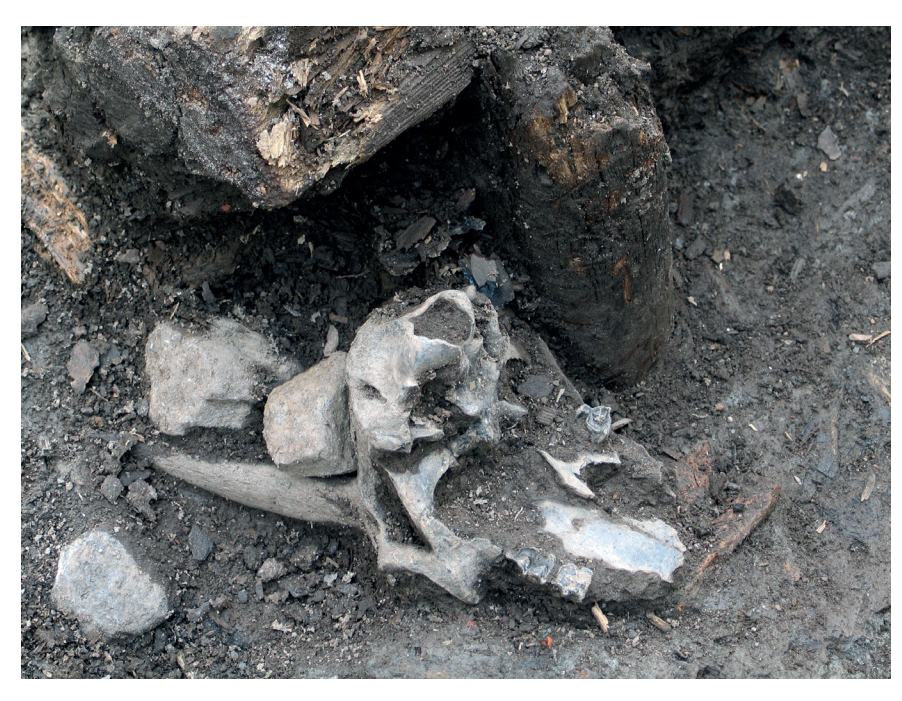
Figure 2 . The skull of a goat found concealed by a log marking the border between two plots.

leave a similar trace in the archaeological record. Archaeology is, however, quite familiar with uncertainty; few interpretations that go even slightly beyond reporting material evidence are definite.