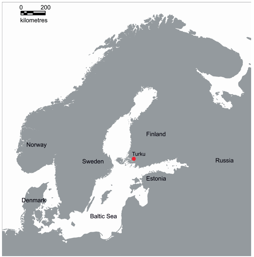
Figure 1 . Turku (Swe. Åbo) situates on the south-western coast of present-day Finland.

Medieval written sources on everyday lived religion are scarce in the area of present-day Finland. However, large archaeological excavations where medieval soil layers are studied have lately been conducted almost yearly in the city of Turku. This fieldwork has unearthed finds that offer unique evidence of the local medieval worldview. Turku (Swe. Åbo) situates on the south-western coast of Finland (Fig. 1). During the medieval period, the area belonged to the Swedish kingdom. In the local chronology, the medieval period begins very late, around the beginning of