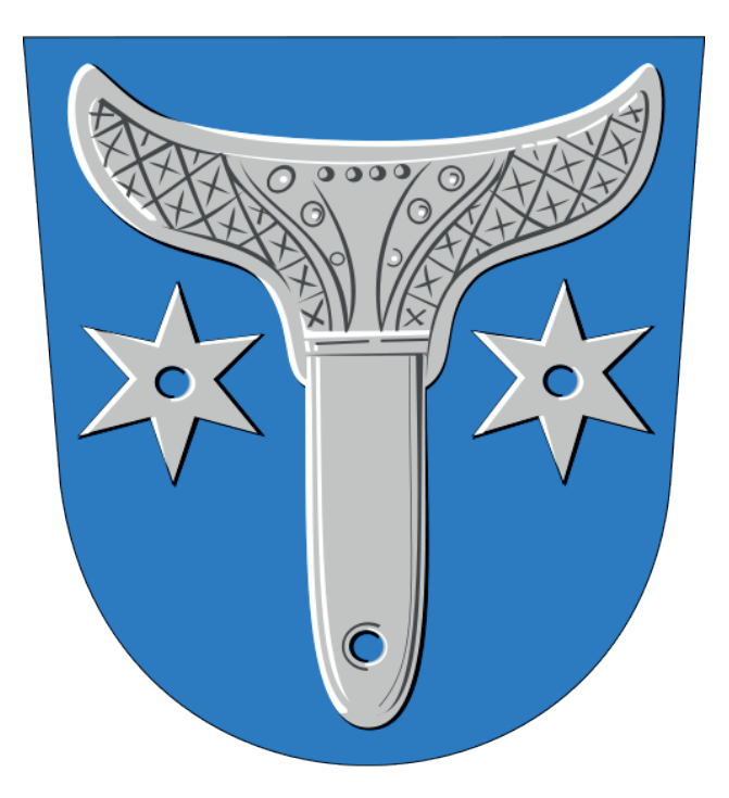
Figure 4. The coat of arms of the Finnish town Kannus displays both the meanings of the word: the T-shaped Sámi shaman drum hammer and the star-shaped rowels of spurs. Design by Gustaf von Numers (1848–1913).

The T-shaped drum hammer of the Sámi is exceptional among shaman drumsticks.<sup>41</sup> Archaeological finds from Norway show that this form was known already circa AD 1000–1200.<sup>42</sup> The shaman's staff is a ritual object that often has the head of an animal on the upper end, and sometimes there are metal objects that make a jingling or rattling sound on the staff.<sup>43</sup> According to Mi-