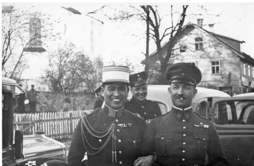
Fig. 3. Lieutenant Colonel Tamotsu Takatsuki (Onouchi’s predecessor) with his French counterpart, Jacques Hoppenot (1939).

Then, between 25th and 27th of July, Onouchi travelled to Stockholm to meet Lieutenant Colonel Toshio Nishimura, then military attaché to Finland and Sweden. 74 There is no official record about their conversation, but it was most