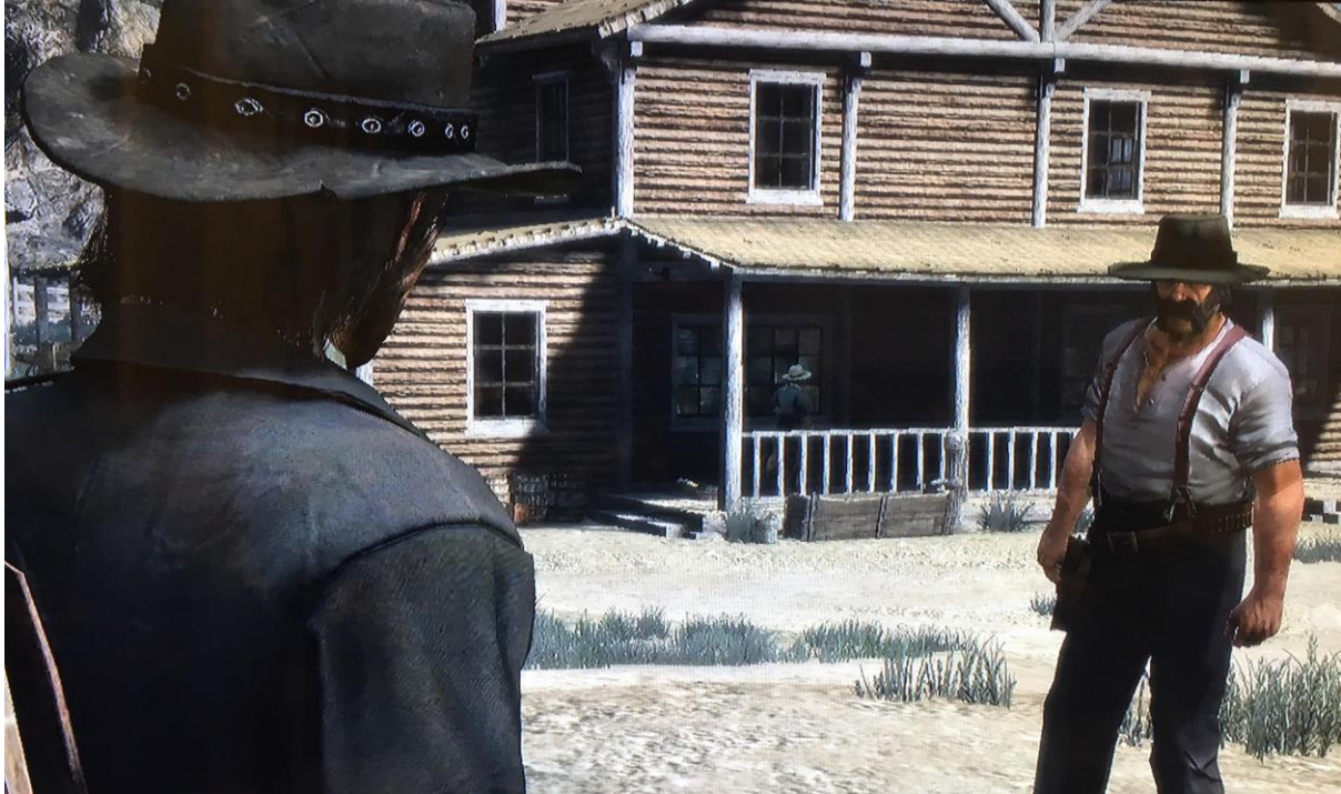
Figure 1. Duels are given special attention in Red Dead Redemption (Rockstar Games 2010), too.

In the shooting part (in which time is slowed down), opponents can be disarmed by shooting their hand or weapon. These small details not present in the normal fighting mode enable classical dramatic Western moments. The sub-mode makes the action of dueling less abstract, and thus more strongly thematized.