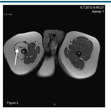
MRI image showing an arrow pointing to the missing quadriceps femoris muscle.

Night-time orthosis treatment was used until the age of 4 years. In clinical examination, there was a 2.5- to 3-cm limb discrepancy, and the knee condyles palpated asymmetrically. Another round of series casting was initialized because of increased extension deficit. Regardless, the range of motion was limited to only 30° to 60° 1 year later.