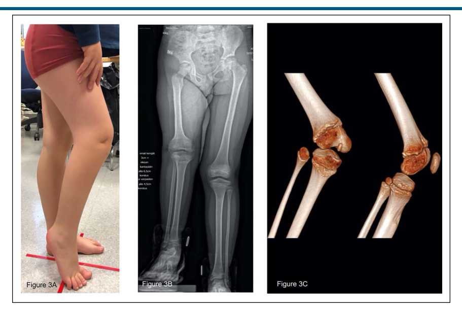
A , Photograph showing the clinical situation at the age of 7 years. B , Long lower limb radiograph at the age of 8 years showing 6.9-cm anatomical limb-length discrepancy. C , 3D computer tomography image showing the bony anatomy in the knee.

followed up after the surgery and is adapting well to his new prosthesis six months postoperatively.