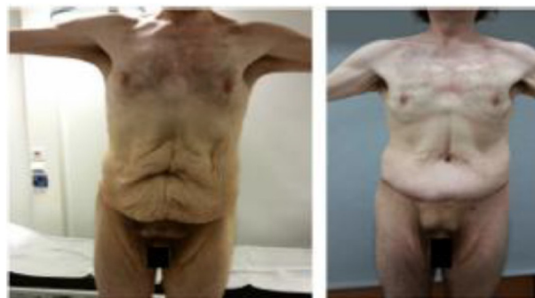
Figure 4 Abdominoplasty.