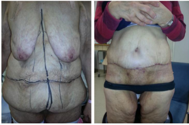
Figure 5 Panniculectomy.

lipectomy or lower body lift. Performing a gluteal reconstruction is crucial in order to avoid a flat buttock without waist definition. 59 The patient is marked in the standing position. Superior and inferior marks are drawn across the lower back, and the distance between them is determined by pinch test and ultimate scar location. The marks are tapered anteriorly into the abdominoplasty markings for a circumferential belt lipectomy or into thigh-lift marks. If gluteal augmentation is planned, the proposed gluteal flaps are drawn between these marks and need to be low enough to allow rotation low into the buttock region. 60