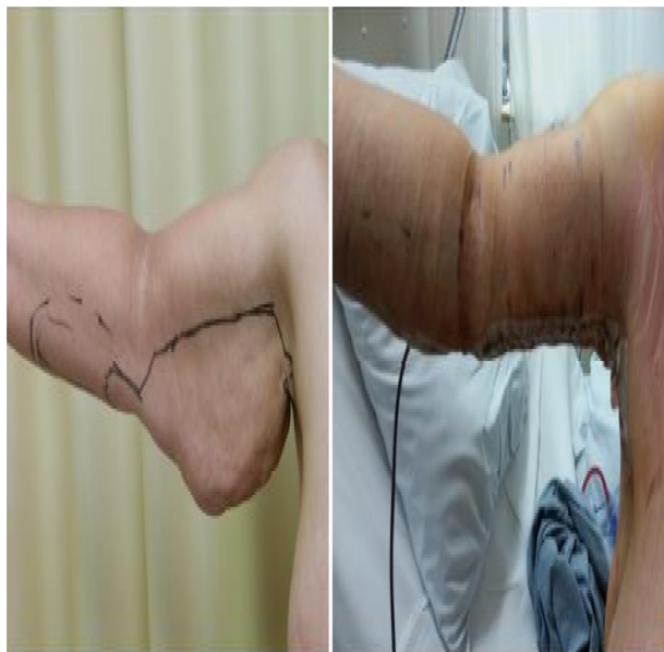
Figure 1 Brachioplasty.

Upper back lift is indicated in patients with a pronounced upper back skin laxity. It is best performed at a different time from lower body lift because of opposing lines of tension. 50 Markings are made, with the patient standing, across the