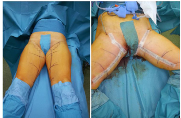
Figure 7 Thigh lift.

Postbariatric surgery patients have a 60%–87% increased risk of complications compared with nonbariatric patients for body-contouring procedures after MWL. 63 The most common complications seen after surgery include wound-healing problems, seromas and lymphoceles, infections, venous thromboembolism (1%–9.3%), 12,39,41 hypothermia (<35°C), 38 lymphedema, hematomas, and nerve injury. Wound-healing problems are the most frequent after