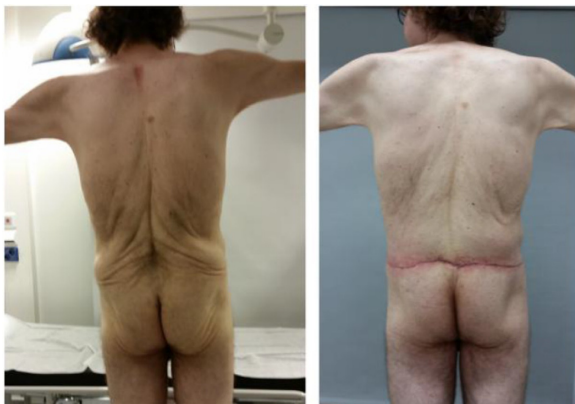
Figure 6 Lower back lift.

The procedure is first performed with the patient in a prone position, incisions are carried out till the deep fascia according to preoperative marks and excess tissue is elevated. Tailor tacking is always advisable to determine the tissue to be removed. If autogluteal augmentation is planned, the gluteal flaps are de-epithelialized and pockets are designed over the gluteal muscles where the flaps will be rotated. 61 The patient is then turned into the supine position for the abdominoplasty. Thigh lift may also be performed at the same time, constituting a total lower body-lift procedure (Figure 6). 52